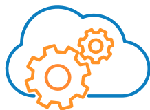
Cloud Native Development & DevOps