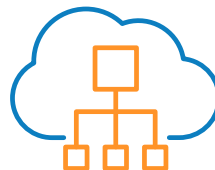
Data, Machine Language, & Artificial Intelligence