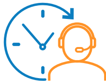
24/7 Managed Cloud Services